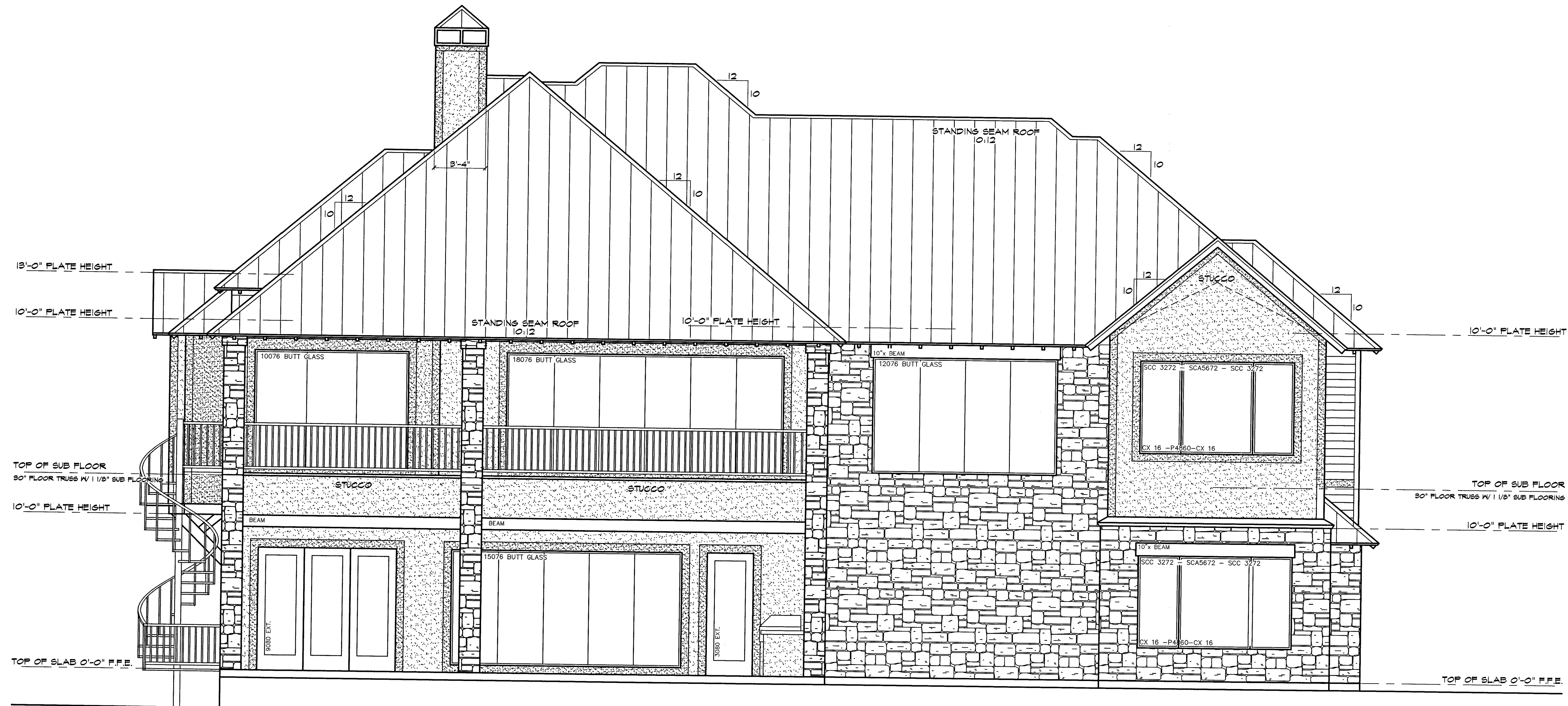
1 REAR ELEVATION SCALE: 1/4"=1'-0"