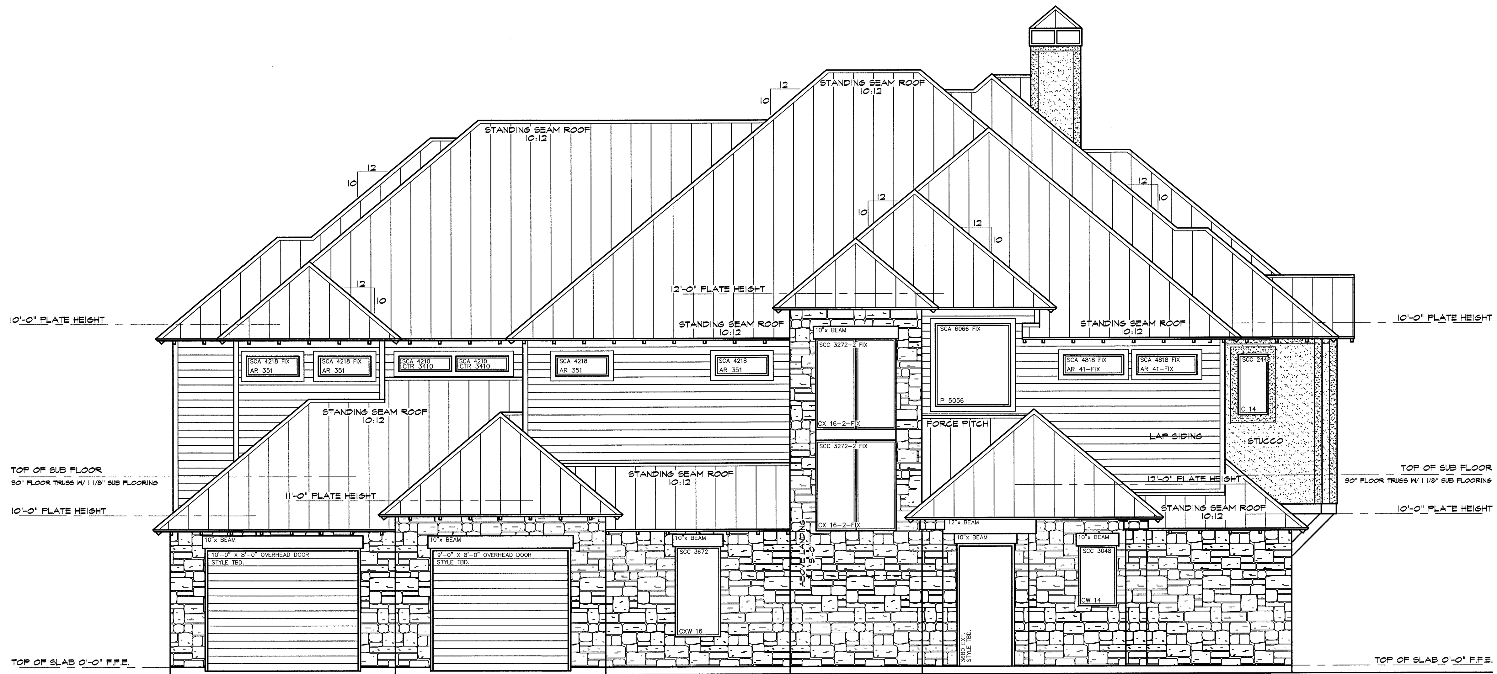
1 FRONT ELEVATION SCALE: 1/4"=1'-0"